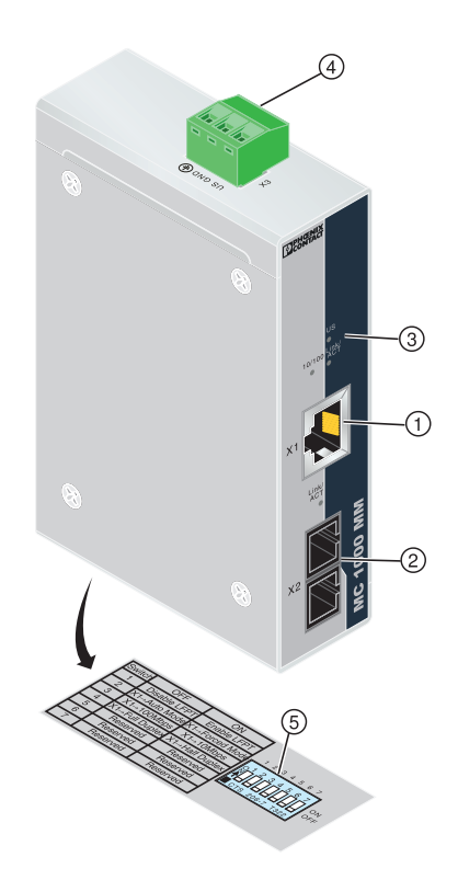
Figure 2 Connectors and LEDs